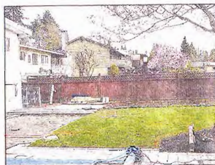
The chill and grill outdoor kitchen, designed for year-round entertaining thanks to heaters and an outdoor fireplace, was created in a formerly bare yard (left).